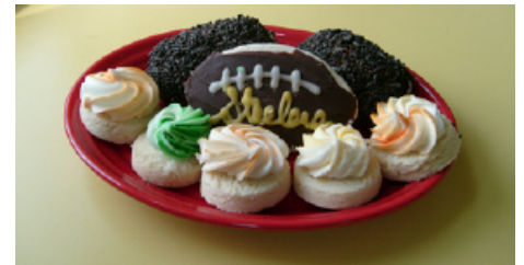
Mmmm. Kribel Bakery thumbprints with a couple of jimie sticks supporting a Steeler cookie.