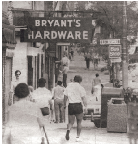
Bryant's Hardware was a mainstay on Brookline Boulevard at the corner of Stebbins Street for 63 years.