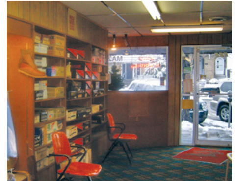
Have you stopped at Mazza Shoe Store & Repair yet?