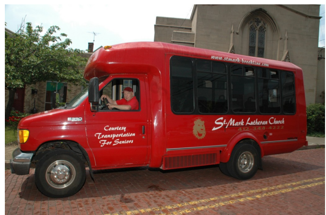
Al Allemang driving the bus.