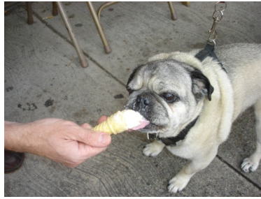
"Since I live on the boulevard, I have a front row seat for the parades," CJ Knecht says. I also live just a block away from Boulevard Ice Cream . There's nothing like a cone on a warm summer day."