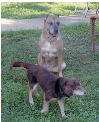
At left : Maxie is sitting and in front is Bingo . They live with Kathy from No Name Coffee Shop . Bingo is blind so Maxie keeps a watchful eye on Bingo .

Select frames and brands of progressive. No other discounts or insurance. Some restrictions apply