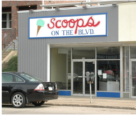
Taking a walk to get an ice cream cone remains an option. While we will miss Chuck Bader and Boulevard Ice Cream , we welcome Scoops on the Boulevard .