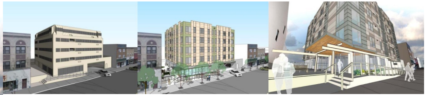
Above from left to right: Mazza Pavilion as it currently looks. Mazza's new look in the middle and at right. At left: A close-up of the new Mazza Pavilion .