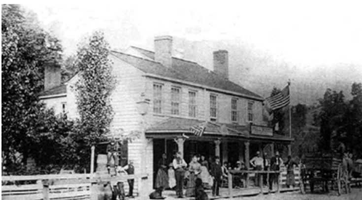
The Bell House Tavern, shown here in 1890 flying a 42-star American flag

Food, drink, and lodging were to be had at Beltzhoover's Tavern and the St. Clair Hotel, both located at the foot of Capital Avenue. Hayes Tavern stood at the southern end of Pioneer, and the West Liberty Hotel at the intersection with Warrington Avenue.