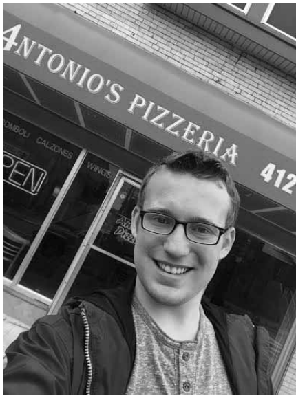
The author outside Antonio's Pizzeria

time, so I ventured inside to order a quick slice of classic cheese pizza and a can of soda.