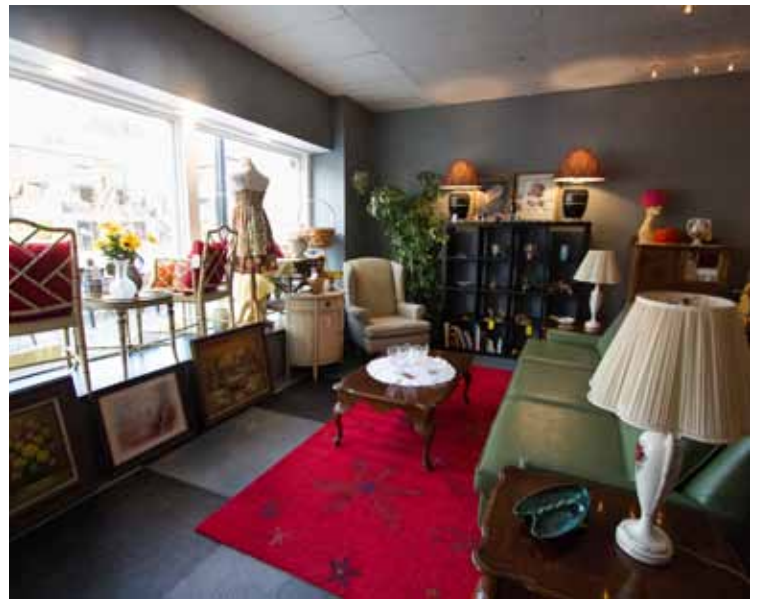
Interior of 824: The Consignment Shop

The inventory changes on a regular basis. My wife and I bought several items that have become welcome additions in our home. When I last visited, items for sale ranged from furniture to glassware and dinnerware, to clothing, jewelry, and purses. Each piece was tasteful and in excellent condition.