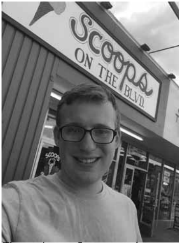
The author at Scoops on the Boulevard