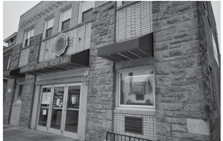
American Legion Building