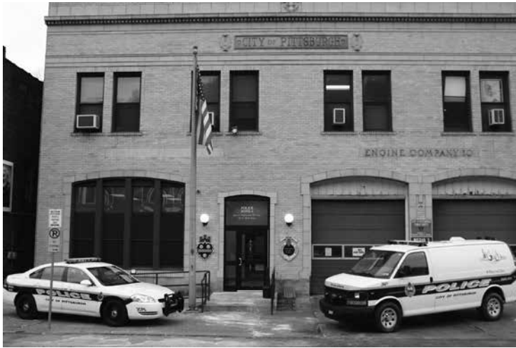
Pittsburgh Police Zone 6 Headquarters

Each year, the City of Pittsburgh publishes an extensive report regarding crime in Pittsburgh for the previous year. The report includes crime figures by Pittsburgh neighborhoods. (It does not address crime statistics in neighborhoods that are contiguous to but outside the City, such as Dormont.) The most recent report available is for 2014. Additionally, each month the Brookline Newsletter publishes preliminary crime figures supplied by the Pittsburgh Police for the City's Zone 6, which includes Brookline.