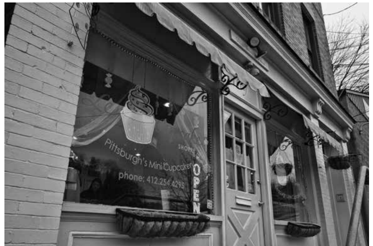
Le Cupcake Shoppe on Capital Ave.

Le Cupcake Shoppe, 412-254-4295, www.lecupcakeshoppegh.com , twitter at lecupcakeshoppe and on Facebook.