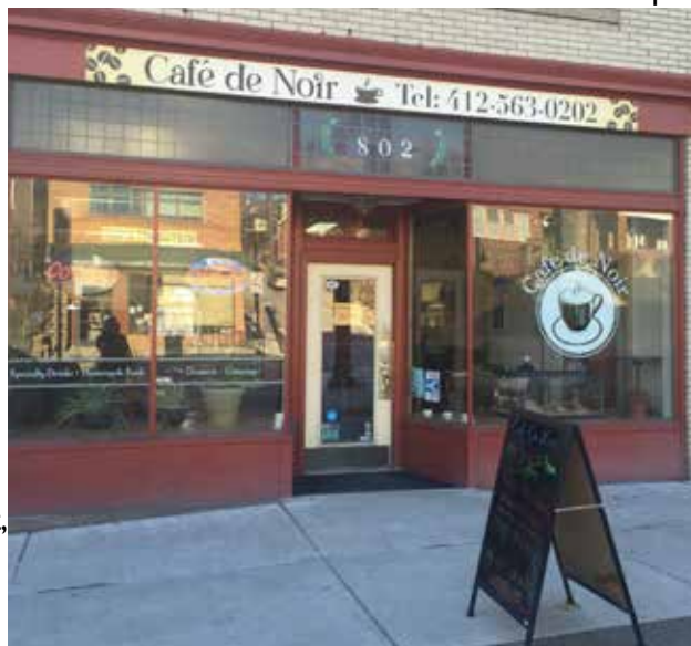
Exterior of Café de Noir