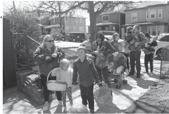
The April 8 event included a stop at the Tree of Life Open Bible Church