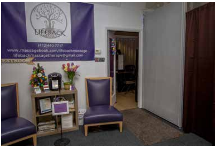
Life Back Massage Therapy

www.massagebook.com/lifebackmassage Facebook: Life Back Massage Therapy Hours: Monday, Thursday to Saturday 9 a.m. to 3 p.m. Wednesday 4:45 p.m. to 8 p.m. Tuesday and Sunday Closed