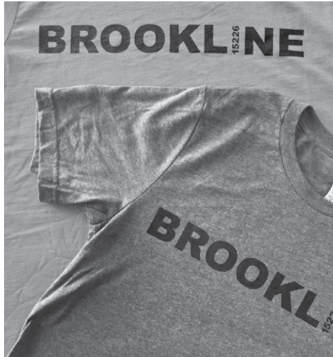
Show your Brookline pride and support Brookline Teen Outreach

neighborhood, look no further. Brookline Teen Outreach is selling exclusive Brookline t-shirts for only $10 each.