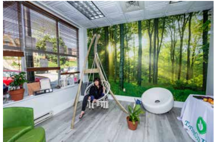
Kelly Bender in the lobby of Thrive on Health

The interior lobby wall includes a traditional receptionist's window that leads to an office, as well as a door that leads into the heart of the building. Walking through this door, the rest of the floor comes into view along a hallway that runs the entire length of the building. This is where Kelly's vision really comes to life.