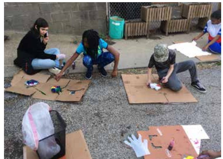
Tie dying shirts

Want to stay informed on all of the things happening at BTO? Like our Facebook page and sign up for our e-newsletter.