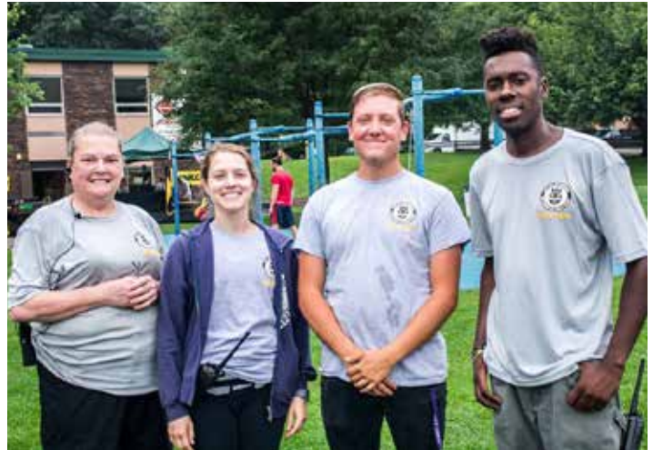
A group of volunteers take a break from their work to take a picture during the Brookline Breeze