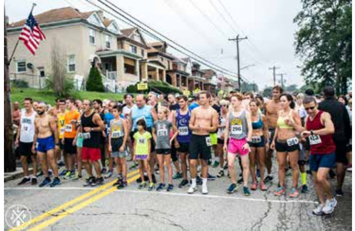
Runners wait for the start of the Brookline Breeze

If you are interested in participating in next year's event or looking to get involved, be sure to visit: brooklinebreeze.com , or email the Committee at: brooklinebreeze@gmail.com