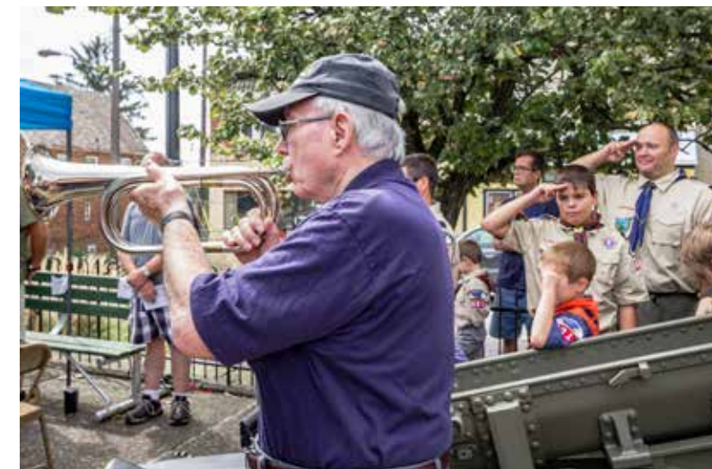
Taps is played during the plaque dedication ceremony.