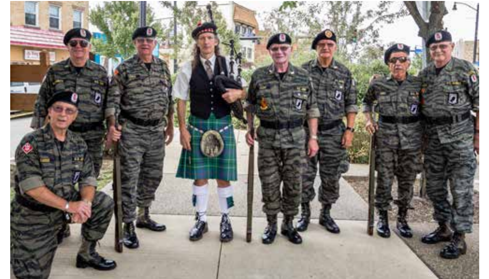
Members of a local veterans group take a moment to pose with a bagpiper.