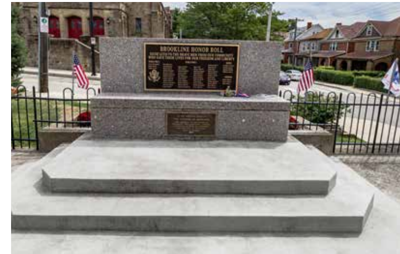
The new Brookline Honor Roll plaque, located in front of the cannon at Brookline Veteran's Park on Brookline Boulevard