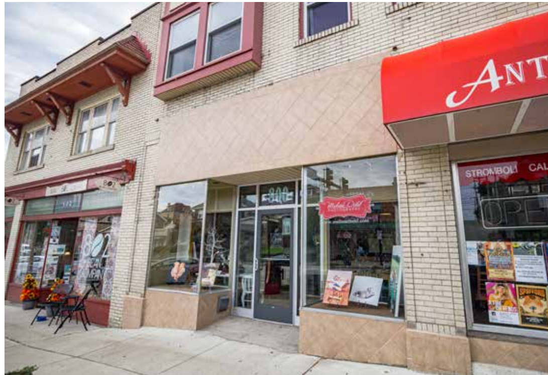
Street view of Melissa Distel Photography from Brookline Boulevard.

a number of years she's been giving back to our community as part of the neighborhood's Light Up Night (the Saturday after Thanksgiving).