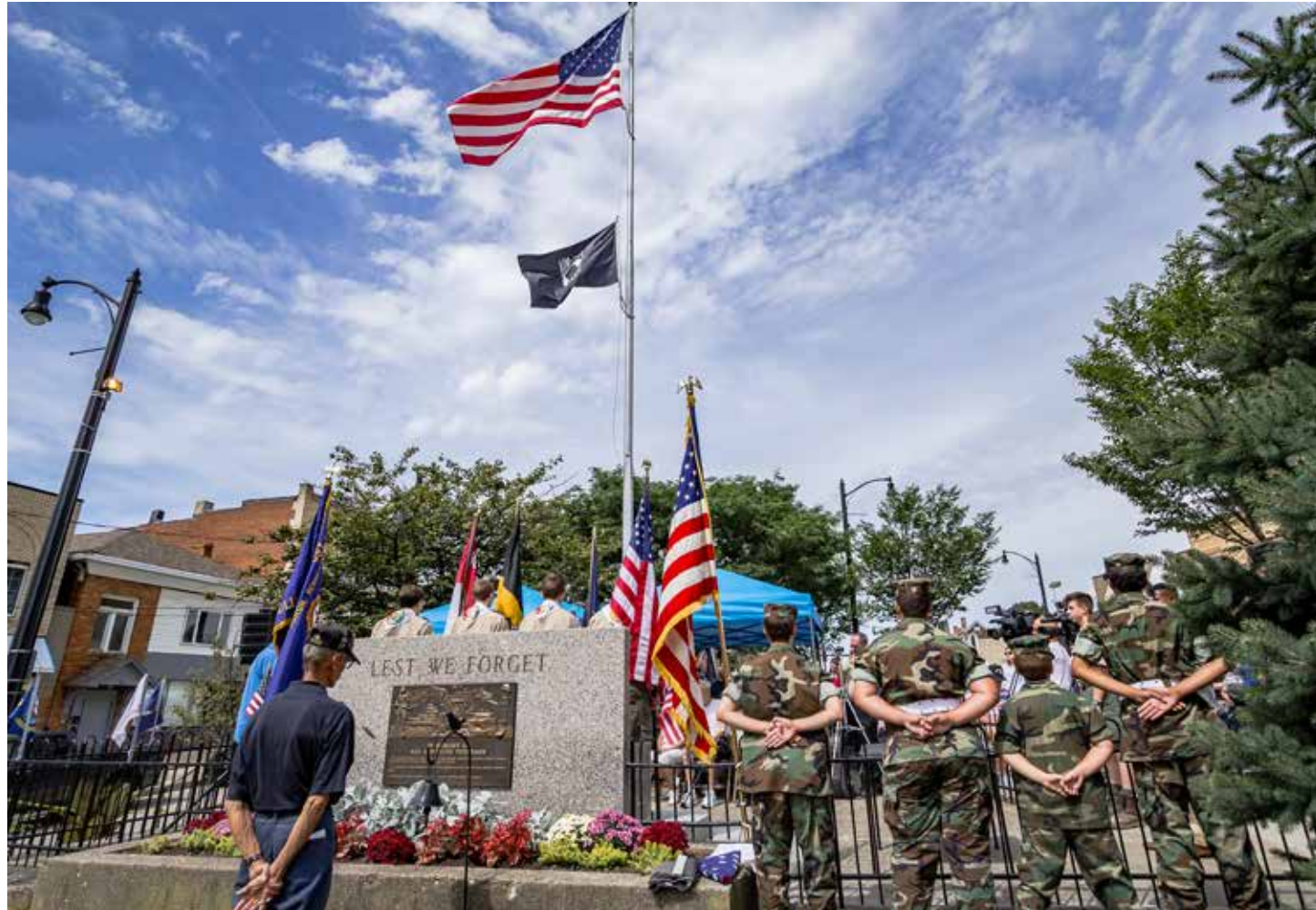
Rear view of plaque during the ceremony.

At high noon on Saturday, August 31, 2019, the Brookline Historical Society hosted a ceremony at the Brookline Veteran's Park and War Memorial to dedicate a bronze Honor Roll plaque listing the fifty-six soldiers, sailors, airmen and Marines that lost their lives during the conflicts of the 20th Century (World War I, World War II, Korea and Vietnam).